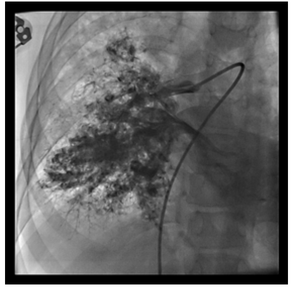
Fig. 1. Right pulmonary artery angiogram shows PAVM and early venous return.