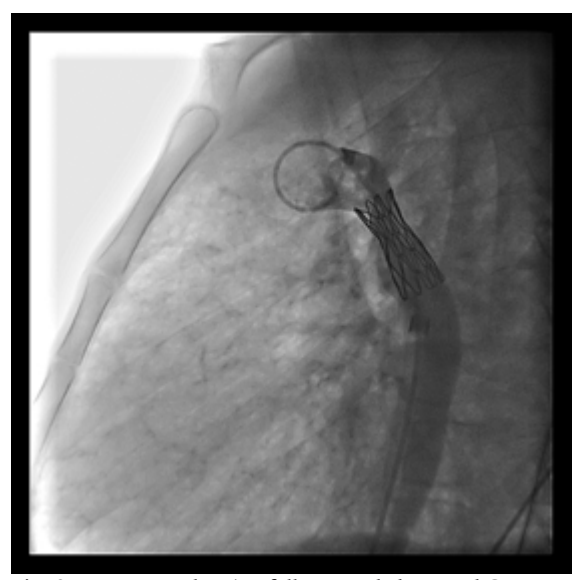
Fig. 3. Aortagram showing fully expanded covered CP stent.

The diagnosis of the PAVF is based on clinical findings such as cyanosis, continuous murmur and persistent radiologic findings. Many of the patients have history of recurrent pneumonia which is usually a false diagnosis because of the radiologic appearance during febrile diseases. Our patient was also followed-up with the diagnosis of chronic lung disease. Contrast echocardiography is helpful for confirmation of the diagnosis by observation of the echo-contrast within the left heart chambers after infusion from a systemic vein.