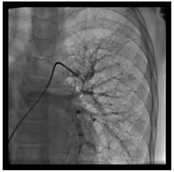
Fig. 2. Left pulmonary artery angiogram shows multiple tiny PAVMs.